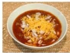
award- winning chili